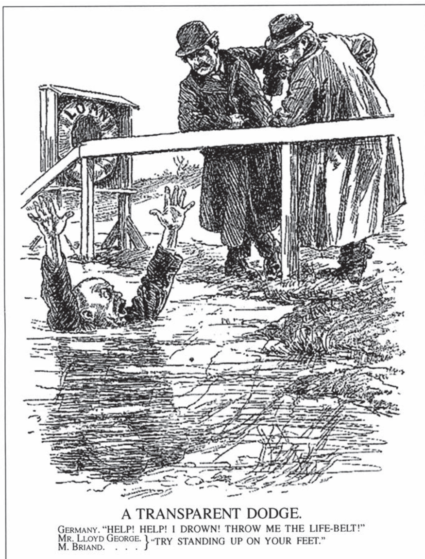
A cartoon from a British magazine, 1921. It shows Germany kneeling in the water. Lloyd George and Briand (the French Prime Minister) are on the right.