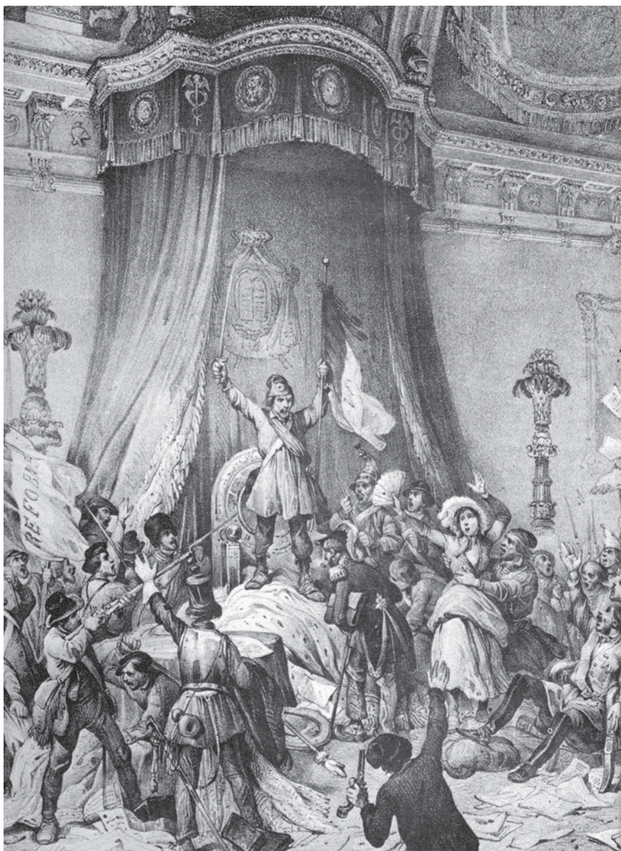
A drawing from the time of the throne room in the Tuileries, Louis Philippe's palace, 24 February 1848.

In 1847 middle class reformers began to hold banquets in Paris. In February 1848 the government banned the banquets. This resulted, on 22 February, in crowds protesting in the streets. Fighting broke out between the crowds and soldiers, and on 23 February, Prime Minister Guizot resigned. Soon there were barricades all over Paris and crowds gathered around the royal palace. On 24 February King Louis Philippe abdicated. On 26 February a provisional government called the Second Republic was established. Conservative forces were horrified by what had happened, but how real a threat to the social order was the February Revolution?